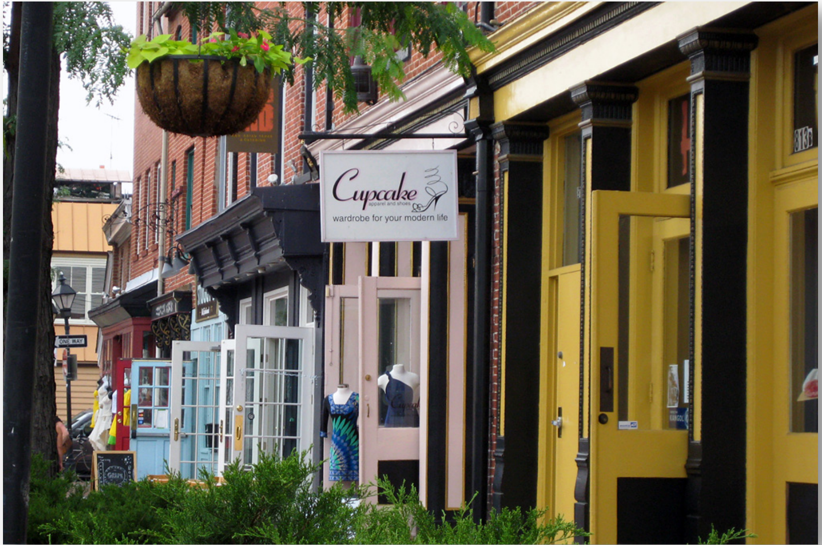
Fell's Point, Baltimore, Maryland